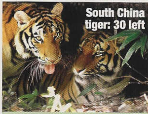
South China tiger: 30 left